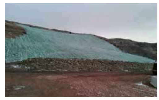
Carus Well Pad Slope Stabilization Near Killdeer, North Dakota